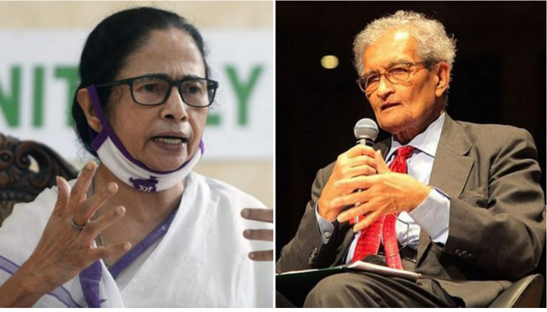
File photos of Mamata Banerjee and Amartya Sen